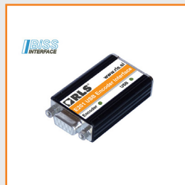
E201-9B USB interface