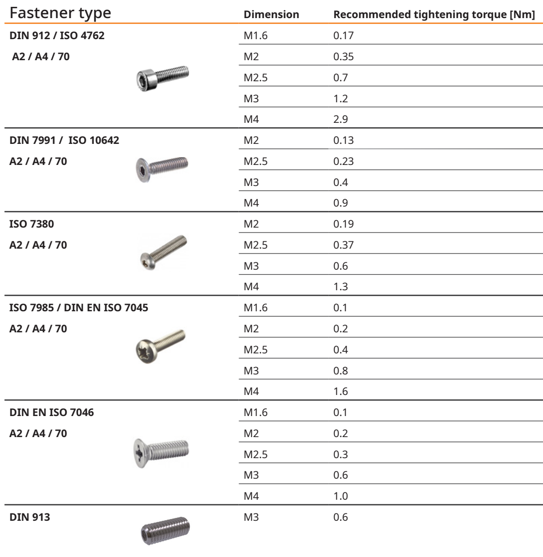
Table of recommended fastener tightening torques for RLS products

The tightening torques in the table apply to dry surfaces, without lubrication and when the effective depth of the screw in the threaded hole is at least 1 \times D_{\text{nominal}} for steel or 2 \times D_{\text{nominal}} for aluminum.