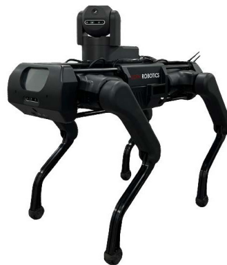
AIDIN ROBOTICS's quadruped robot

motors, and reducers; sensors that provide feedback data on position, speed, and torque; and a controller, which acts as the robot's brain.