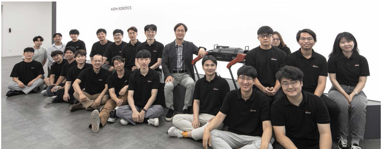
AIDIN ROBOTICS team

Dr. Kim stated, "In the future, our quadruped robot will consider adopting a dual-encoder design, meaning that one encoder will be placed at the input and another at the output. By comparing the positional information and speed data from both encoders, as well as the output of the driving current and motor torque, we can assess the magnitude of external forces acting on the joints, thereby enabling safe control of the robot."