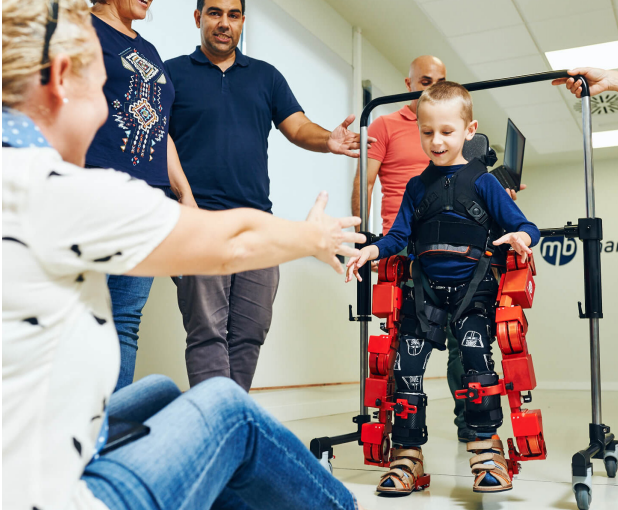
The ATLAS 2030 exoskeleton is designed for children with paraplegia, tetraplegia, spinal muscular atrophy, and congenital muscular dystrophy