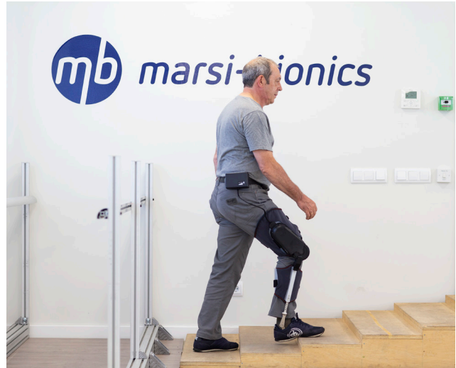
MB-Active Knee working in a patient with stroke hemiplegia.

RLS magnetic encoders have enabled Marsi Bionics to design and build exoskeleton orthopaedic devices that could improve the quality of life for people suffering from diseases such as SMA, hemiplegia caused by stroke and multiple sclerosis. Active exoskeletons will particularly