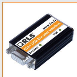
E201-9B USB interface