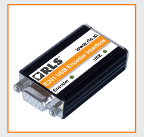
E201-9B USB interface