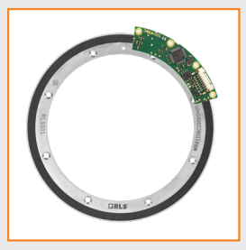
AksIM-4 off-axis absolute magnetic encoder