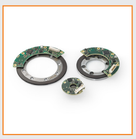
AksIM-2 off-axis absolute magnetic encoder