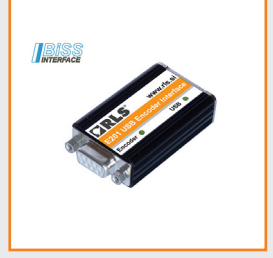
E201-9B USB interface